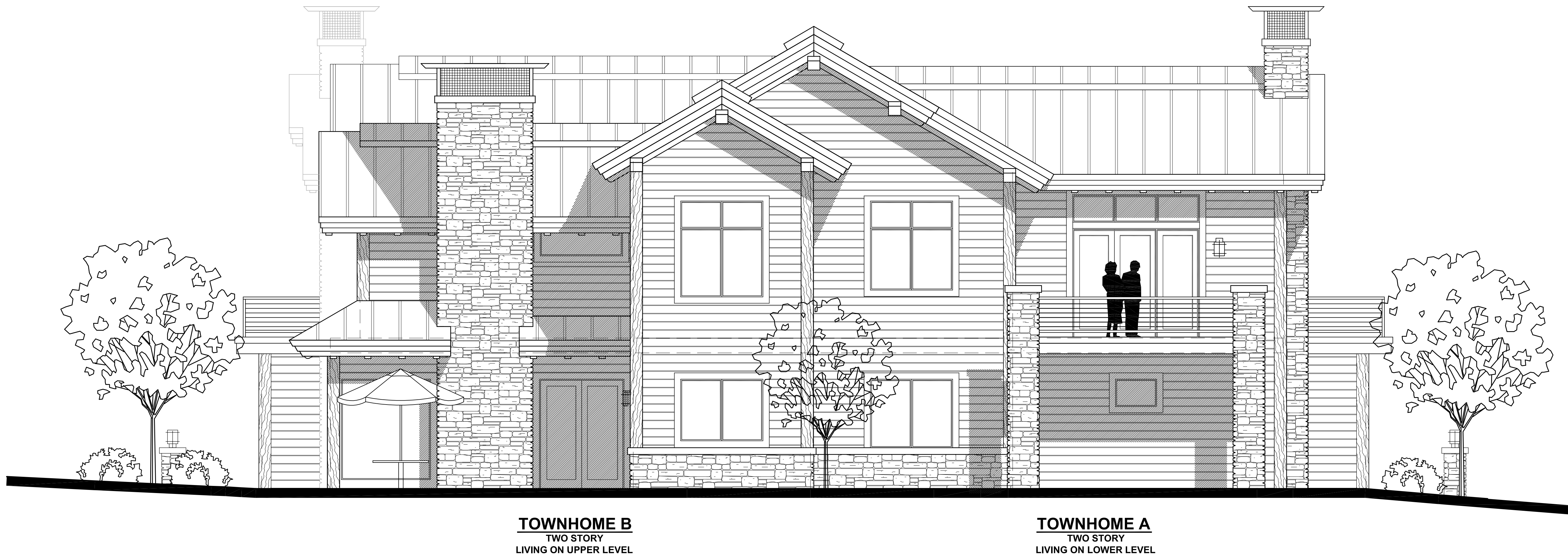
TOWNHOME B TWO STORY LIVING ON UPPER LEVEL